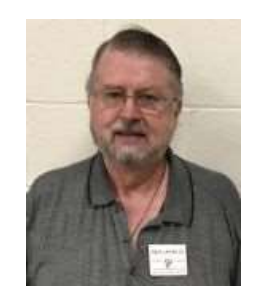
KNOTES FROM THE GRAND KNIGHT